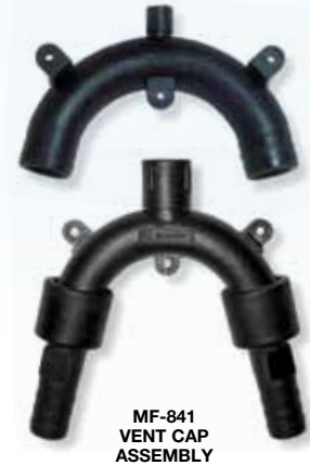
MF-841 VENT CAP ASSEMBLY